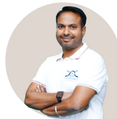
Dr. Rajamahendran Surgery