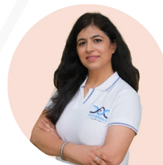
Dr. Pallavi Dermatology