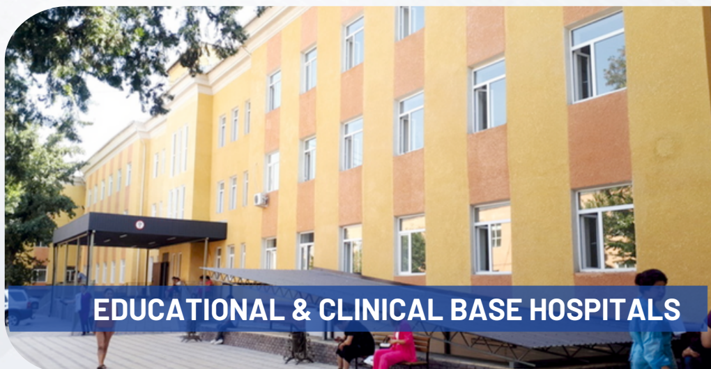
EDUCATIONAL & CLINICAL BASE HOSPITALS