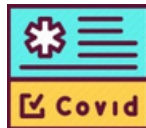
HIV & COVID Report